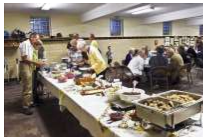
Above: A great meal and many diners were a part of the 125th Anniversary Swedish Smorgasbord on October 2nd. Below: Crop Walk for Hunger was held on October 2nd. Sinai pledges totaled $625.00 this year!